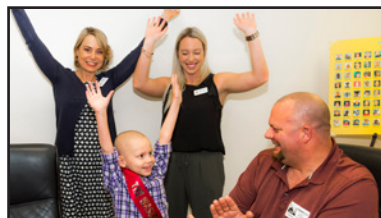
“Share the Joy” Child Sponsor The Wasie Foundation