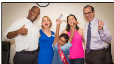
“Share the Joy” Child Sponsor Daoud’s Fine Jewelry